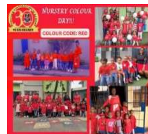
LEARNING USING COLOURS IN EARLY YEARS IS A MILESTONE THAT REPRESENTS A CHILD'S COGNITIVE UNDERSTANDING, WE TOOK IT TO A WHOLE NEW LEVEL THIS TERM.