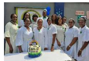
PEARL ANNIVERSARY/UNVEILING OF LOGO: PRAISES, WORSHIP, PRAYERS, POMP AND PAGEANTRY WERE THE HALLMARKS OF OUR 30 TH ANNIVERSARY/LOGO UNVEILING CEREMONY ON WEDNESDAY, 18 TH JAN, 2023.