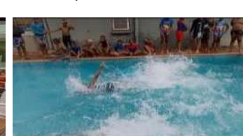
THE SWIMMING COMPETITION OF OUR INTER-HOUSE SPORTS WAS INTENSE AND KEENLY CONTESTED. THE SWIMMERS, SPECTATORS AND THE UMPIRES ALL HAD LOADS OF FUN.