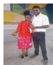
RANDOM PICTURES FROM OUR IN-HOUSE CELEBRATION OF THE GREATEST VIRTUE, LOVE!